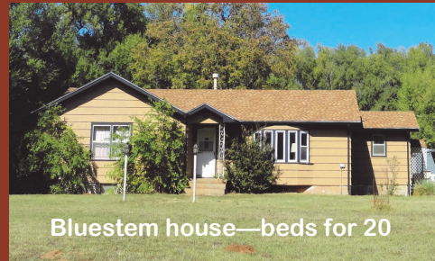
Bluestem house—beds for 20